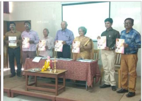
Publication of Proceedings