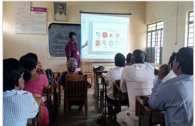
Workshop on Teaching Module