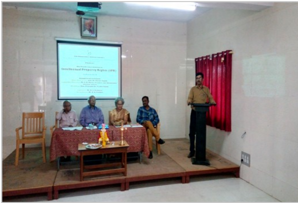
National Seminar on IPR