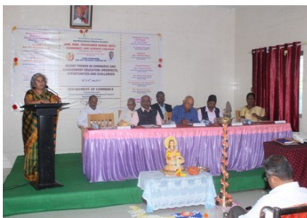
National Seminar (Dept.of Commerce)