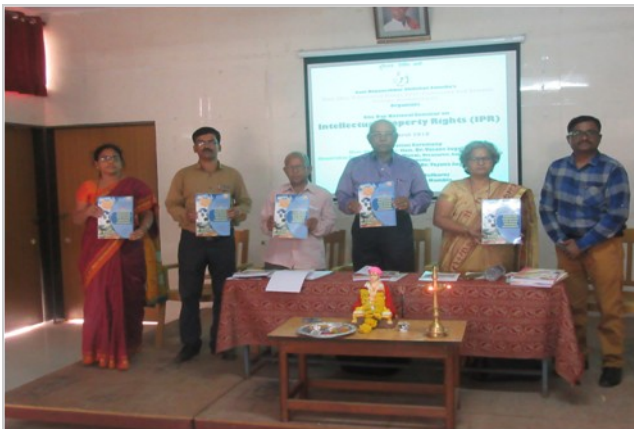
Publication of Seminar Proceedings