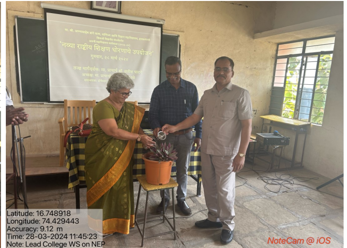
1. Inauguration of the Workshops; 2. Introduction and Welcome