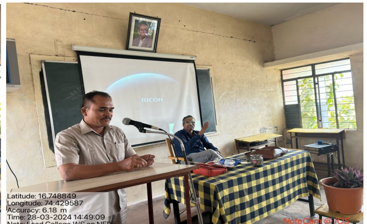
4. Address of Resource Person; 5. Sharing of views by the Participants