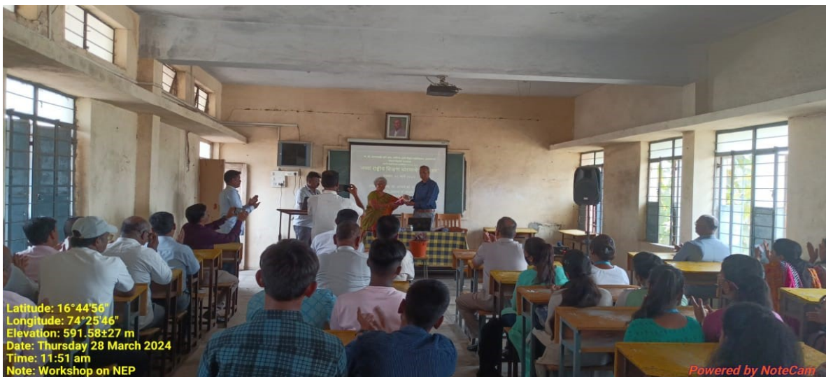
3. Felicitation of the Resource Persons