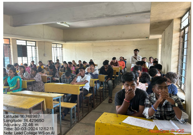
3. Address by Resource Person; 4. Q and A Session