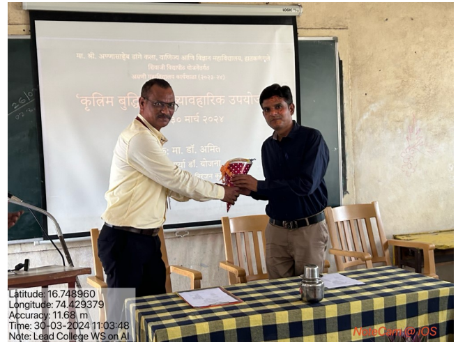
1. Introduction and Welcome; 2. Felicitation of the Resource Person